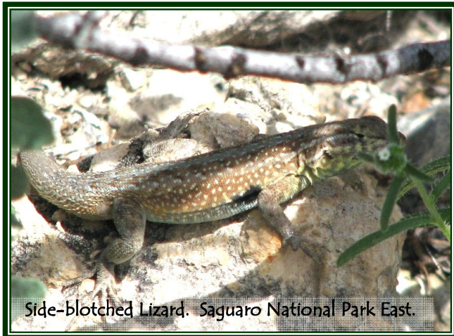
Side-blotched Lizard. Saguaro National Park East.

April is the one month that is Spring in southern Arizona. Sandwiched between the cool temperatures of winter and the heat of summer, April is a great time to be outdoors. In the past couple of days, I have seen my first Zebra-tailed and Side-blotched Lizards of the year and the first Canyon Treefrog of the season was spotted in Madera Canyon yesterday. Black-chinned Hummingbirds, Swainson's Hawks, Hooded Orioles, and many other birds are arriving on their southern Arizona breeding grounds or are passing through on their way further north. Butterfly and dragonfly activity is still pretty low, but that will change in the next couple of weeks. In short, April is a great time to be outdoors in southern Arizona.